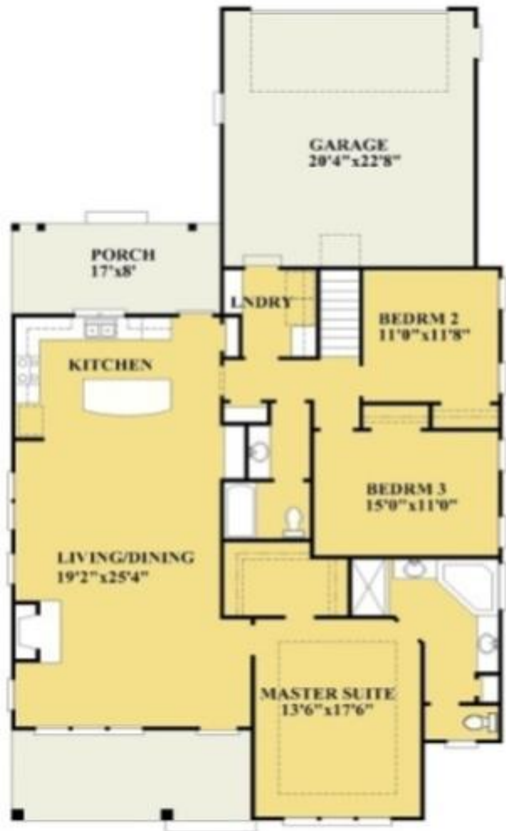
FIRST FLOOR PLAN 1697 HEATED SQUARE FEET