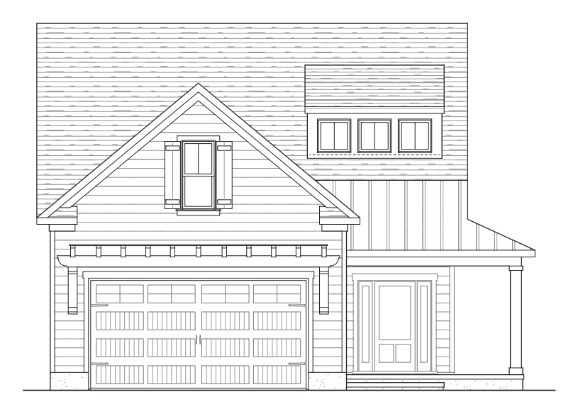
Optional Wrapped Porch